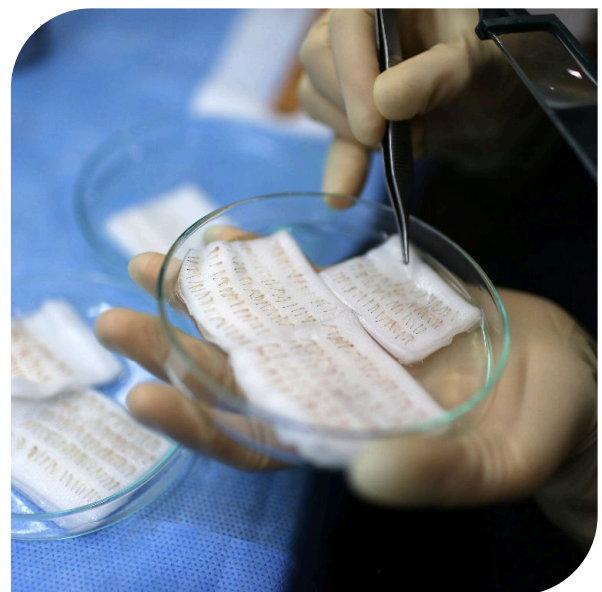
The hair transplant procedure consists of a few steps including follicle extraction and follicle placement.

Have an open conversation with Dr. Vikram to align your expectations with achievable results. Understanding what to expect can help ease any anxiety and improve your confidence in the process.